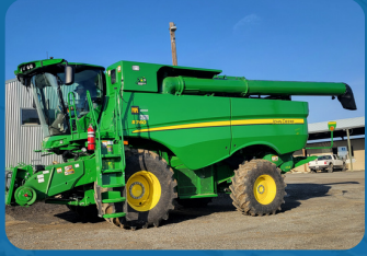
Reville Farms purchased this clean tractor with funding from the FARMER incentive program .

If you have any questions about the program or process, please email grants@ysaqmd.org or call the District Office at (530) 757-3650.