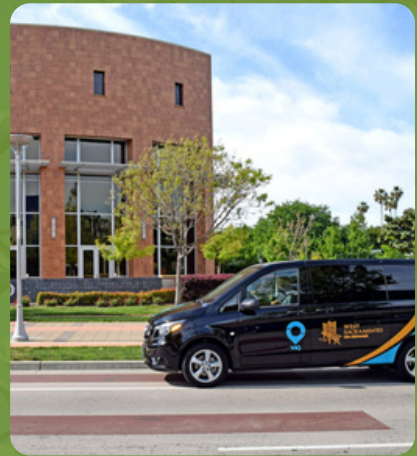
The City of West Sacramento received a Clean Air Funds grant to kickstart its Via Rideshare Program.